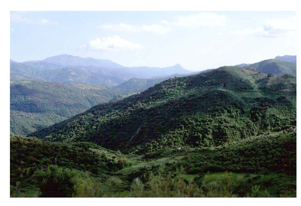
Hispania est provincia Romana.

1st declension -ae 2nd declension -i 3rd declension -is